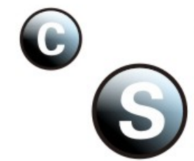
CS-168 Type High-frequency Infrared Carbon-Sulfur Analyzer